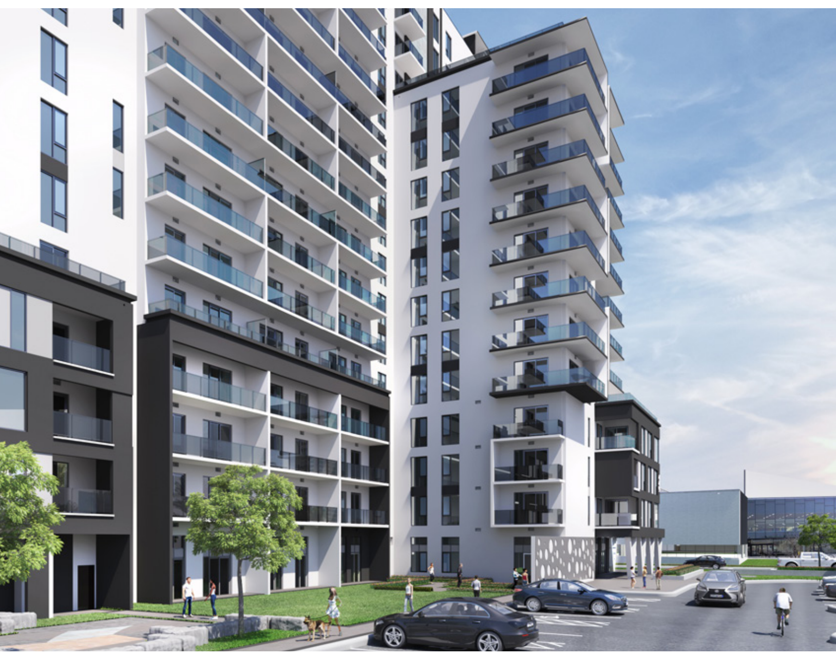
Rendering is artist's concept only and is subject to change without notice. See sales representative for details. E. & O. E